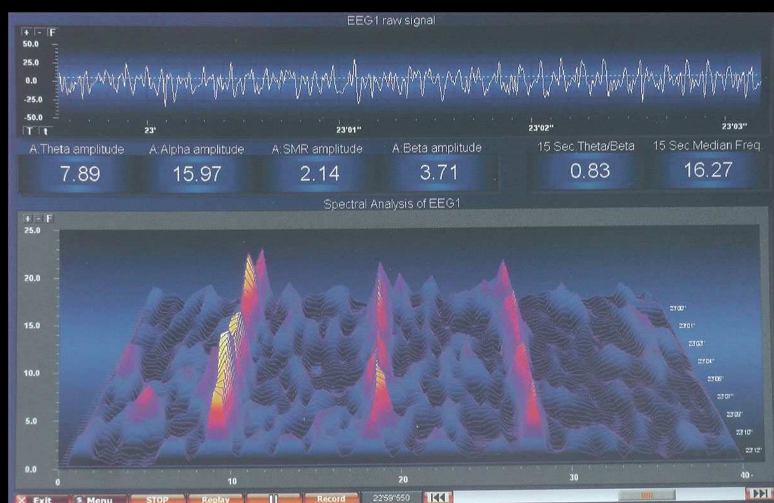
Example of the frequency pattern during HYPNAGOGIC LIGHT EXPERIENCE.